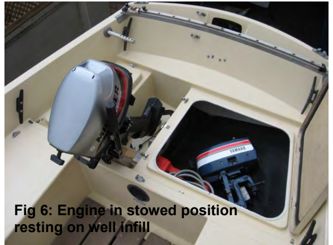
Fig 6: Engine in stowed position resting on well infill