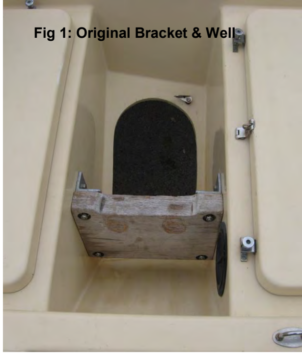
Fig 1: Original Bracket & Well