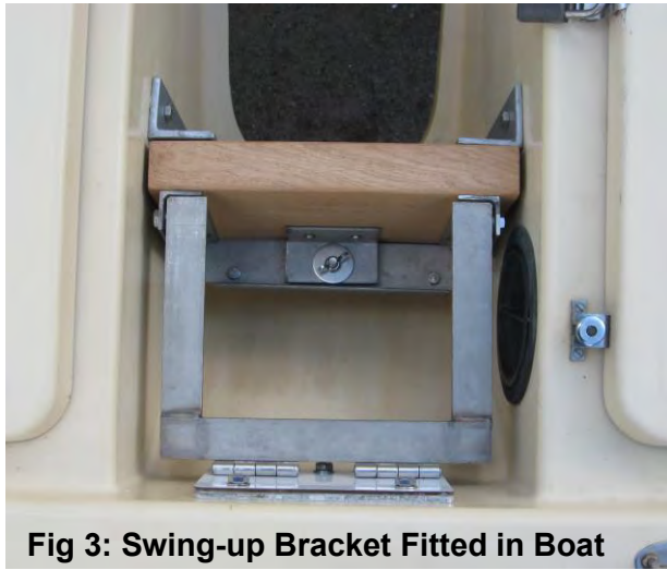
Fig 3: Swing-up Bracket Fitted in Boat