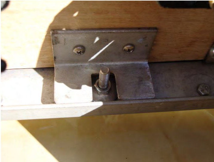
Fig 11: Thrust Block Arrangement Before Fitting Securing Washers & Wingnut