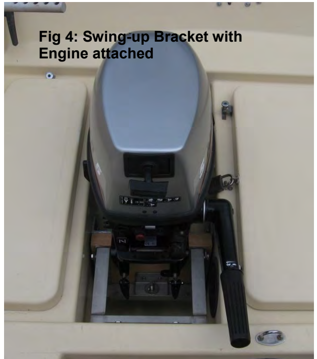
Fig 4: Swing-up Bracket with Engine attached