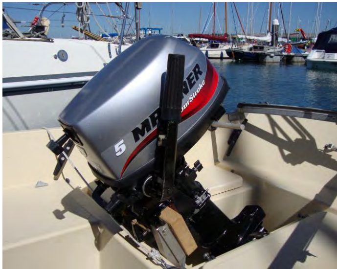
Fig 7: Engine in Stowed position