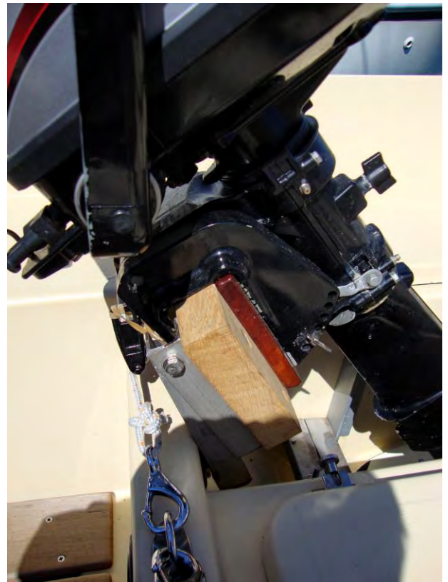
Fig 8: Engine Mounting Pad with Bracket Fully Raised