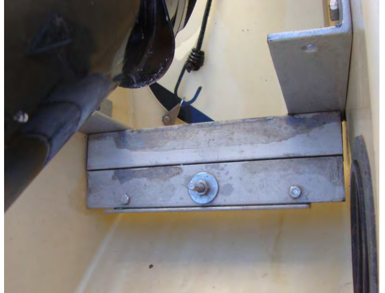
Fig 10: Fixed Support & Thrust Block Angle