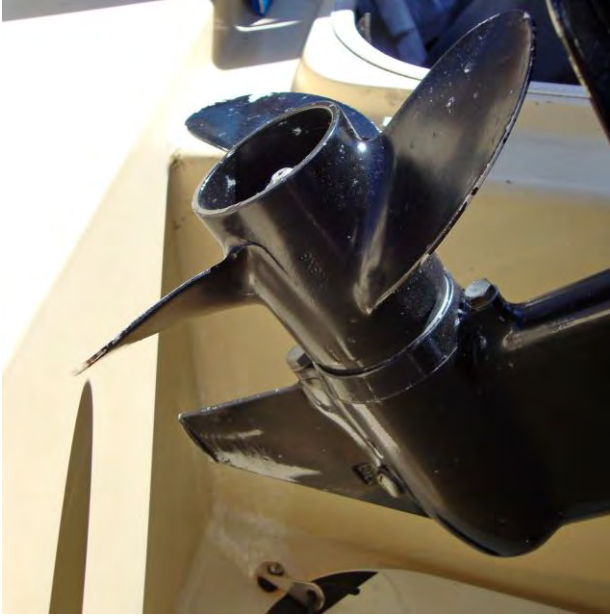
Fig 9: Prop Clearance at Aft End of Well